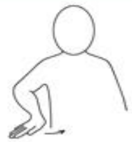
Garden = Farm